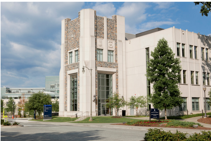
The Duke University School of Nursing, where the research team was based.

Although the study team was able to find participants through a pre-existing registry, the original consent participants signed didn't speak clearly to the duration of the specimen storage. Because of that, the team needed to develop an amendment.